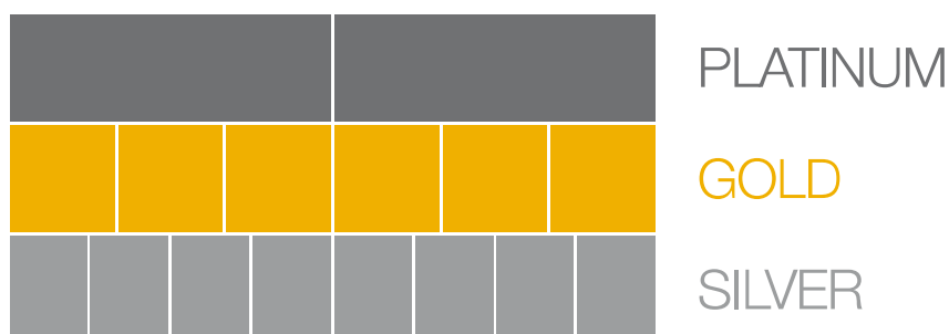
Proportion for advertising division